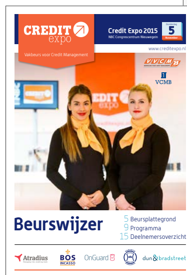
Credit Expo fair guide